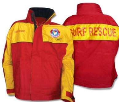
Waterproof patrol jackets